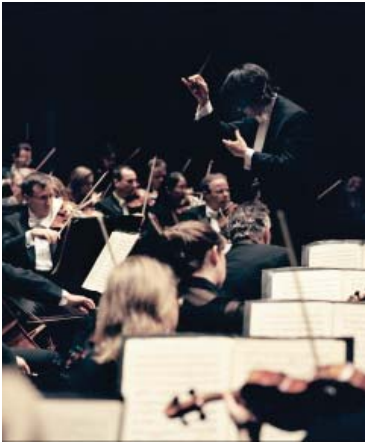
Kent Nagano and the OSM.

C ome and experience the enchantment of one of Quebec's most spectacular regions: Lanaudière. Our tour is specially designed to reveal the region's rich cultural and religious heritage. Let yourself be guided through a talented faience artist's studio and a painting symposium.