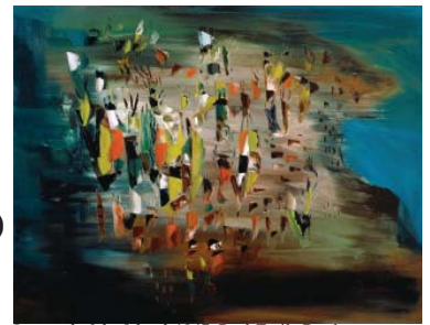
Leeward of the Island, 1947. Paul-Émile Borduas

RESERVATIONS : Please complete and return the form below along with your cheque payable to the Volunteer Association of the MMFA to the following address: